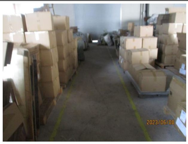
Finished goods area