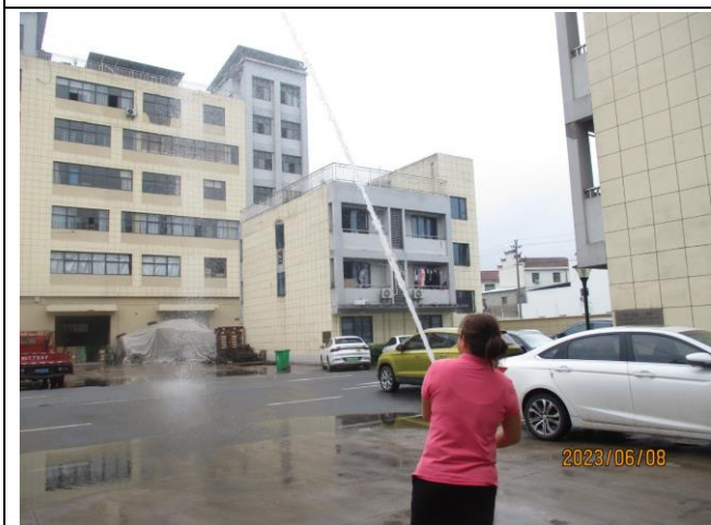
Fire hydrant testing