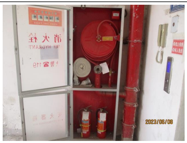
Fire extinguishers and Fire hydrant