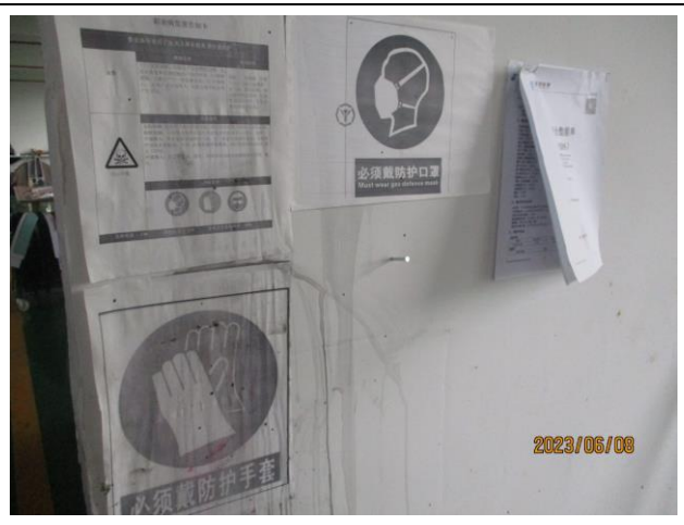
PPE warning sign