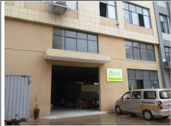
Factory entrance with name