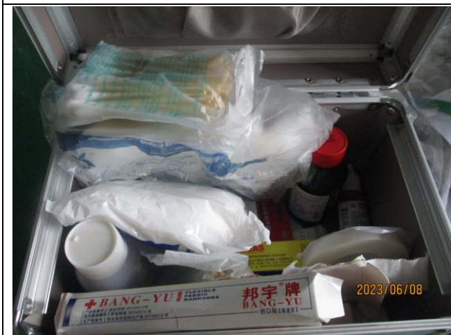
First aid kit