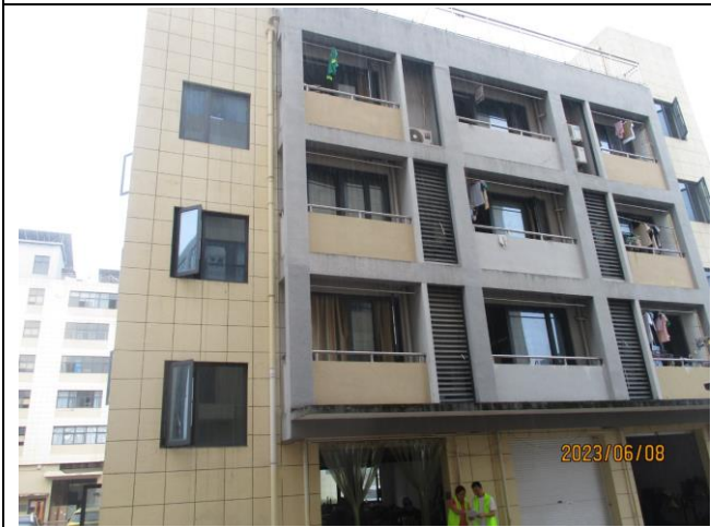
Dormitory and canteen building