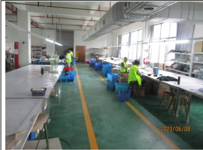
Inspection and packing