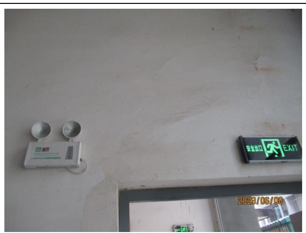
Emergency light and exit sign